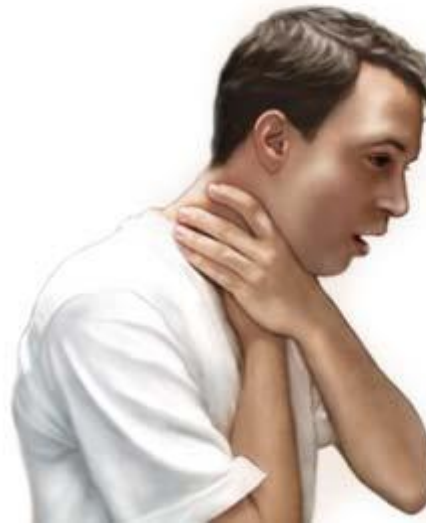
Universal sign for choking

If choking is occurring, begin to perform the Heimlich maneuver . If you're the only rescuer, perform the Heimlich maneuver before calling 911 (or your local emergency number) for help.